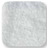
Webri® I Padding