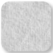
Webri® II Padding