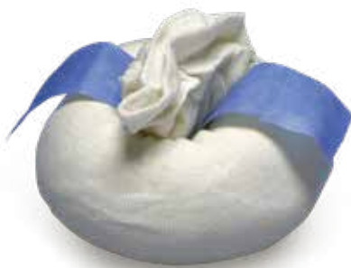
EZ Pull Tabs